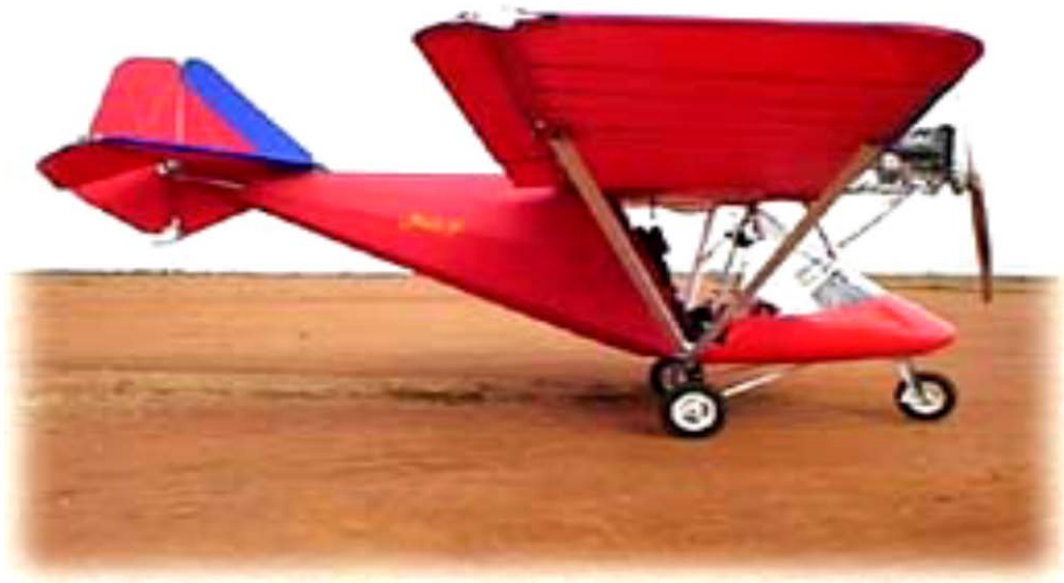
ILLUSTRATION OF AIRCRAFT